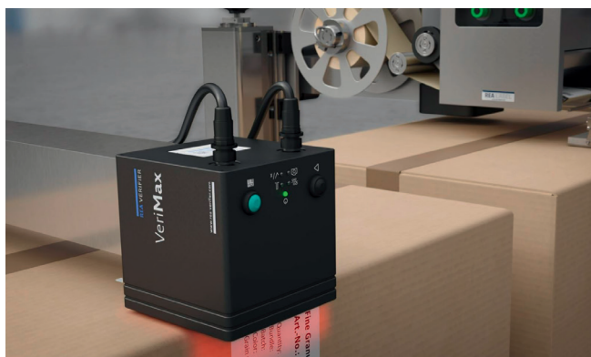
Code verification in the running process

Using the REA VeriMax, you can quickly find out if you are in compliance with the legal quality specifications in the pharmaceutical industry as well as user specifications, e.g. in retail. The detailed measurement results allow a precise analysis of the code properties as a basis for optimizing the print quality of your codes.